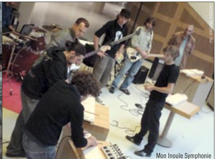
Mon Inouïe Symphonie