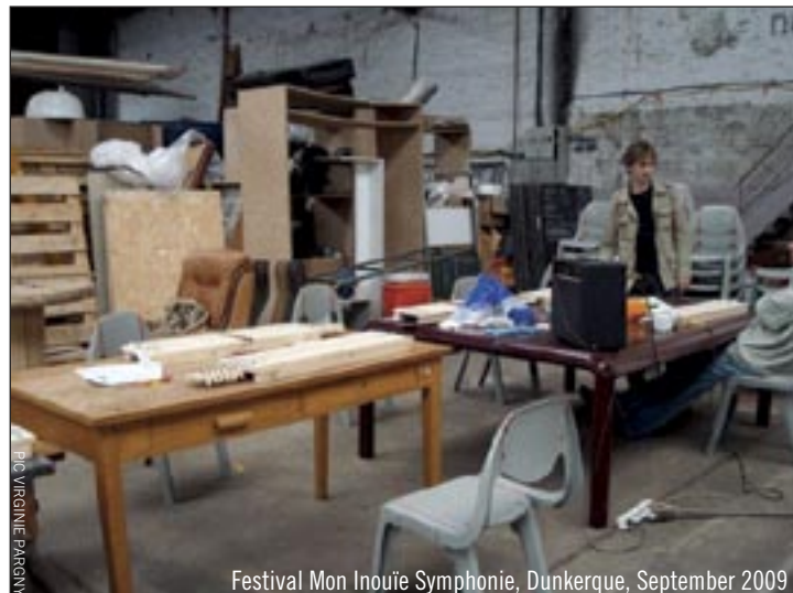
Festival Mon Inouïe Symphonie, Dunkerque, September 2009

To see Yuri's instruments and read more about them look at www.hypercustom.com