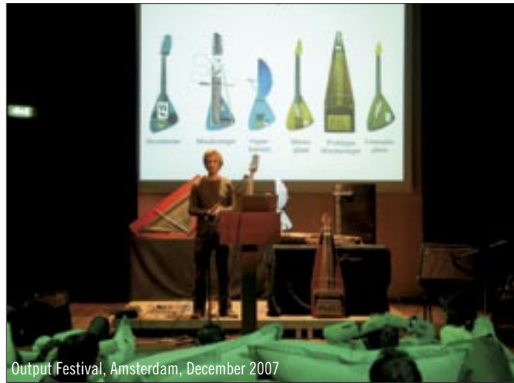
Output Festival, Amsterdam, December 2007