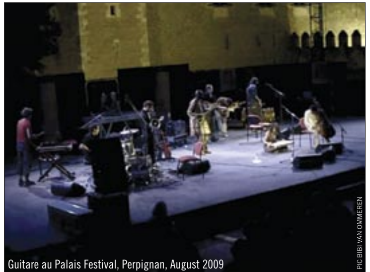
Guitare au Palais Festival, Perpignan, August 2009

An additional second day can be planned in which the group of builders create an ensemble performance. The participants play an easy to learn musical theme, starting in a minimal structure one by one, with each introduction creating more sonic complexity and volume, resulting in a “wall of sound” crescendo comparable with the drone works of Sonic Youth or the symphonic guitar compositions of Rhys Chatham and Glenn Branca.