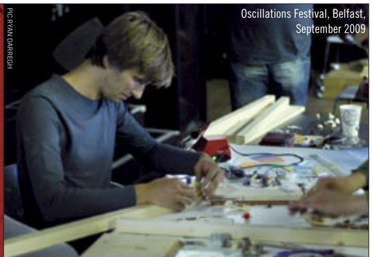
Oscillations Festival, Belfast, September 2009